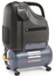
AH 10 E 6

AH series oil-free compressors are designed for a variety of applications. With no oil to replace and with the electric motor flanged to the compressor block, maintenance is reduced to the absolute minimum. Their all-aluminium, low-weight construction makes them the ideal choice when a smaller amount of compressed air is sufficient. They can be laid flat for transport.