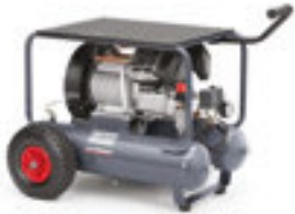
AF 30 E 2