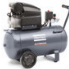
AF 25 E 50