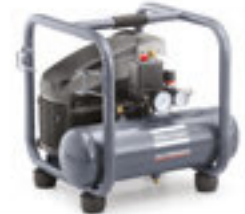
AF 25 E 6

AF Series , 230 V1 phase 10 bars/145 psig for AF 25 , 400 V 3 phases 10 bars/145 psig and 230 V1 phase 10 bars/145 psig for AF30 Direct drive stationary or mobile -9, 10, 2 x 11, 20, 24, 50 or 90 liters horizontal receiver