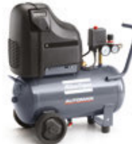
AH 15 E 24