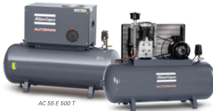
AC 55 E 500 T