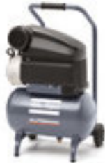
AF 20 E 10