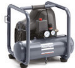
AH 20 E 6