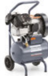
AF 30 E 24