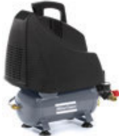
AH 15 E 6